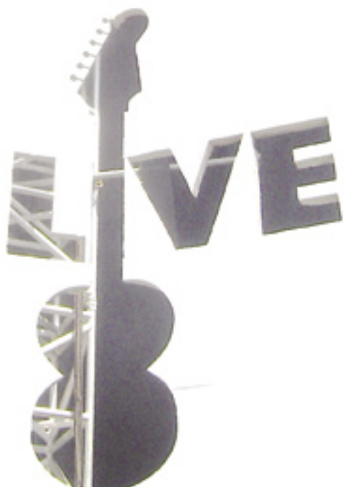
Above: Outline played a major role at the Live 8 events held in Rome and London. Outline's 'Kangaroo' system was used in the back stage artist and VIP area at the London concert, whilst at the second site, in Circus Maximus, Rome, 20 Outline 'Butterfly' hi-packs and 'Victor Live' sub bass systems for side-fill duties were used. 24 'H.A.R.D 212 SP' provided coverage as artist monitors