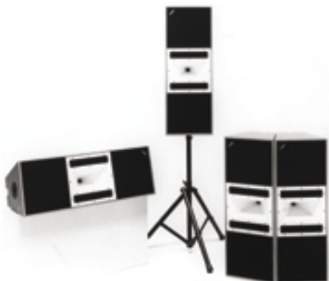
Below (centre & far right): the Outline Butterfly hi-pack combines with the low-pack to create the highly successful line array system